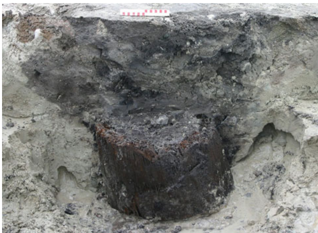
Fig. 3 One well from the site of Frydenlund that contained a lining made from a hollow tree trunk

smaller houses, several graves and five wells were found. The most interesting structure in this context was a huge well. It was so large ( 6.40 \times 4.48 m in diameter and 2.35 m in depth) that it was excavated with the help of a