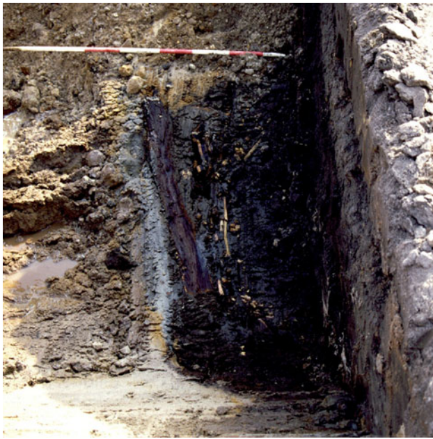
Fig. 4 The well from the site Bjerggård with a lining made of wickerwork. At the bottom of the pit, plant stems were discovered which were identified as flax