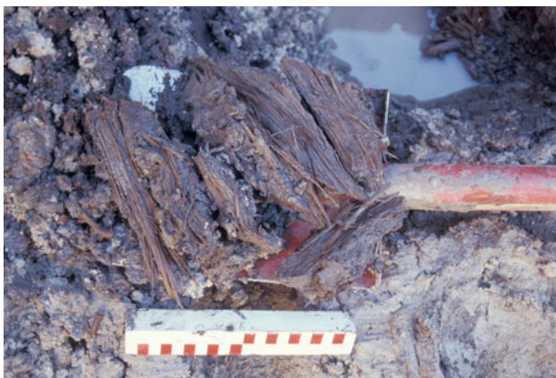
Fig. 5 Flax stalks found in a retting pit at Helstedgård Sydvest

2004 by the City Museum of Odense (Gotfredsen et al. 2009). The presence of more than 30 waterlogged pits and wells indicates that the site was more than just an ordinary farmstead. Both the cultural layer and a great number of the structures contained artefacts such as jewellery, glass and glass beads, combs, scrap from different types of metal production and large amounts of animal and fish bones.